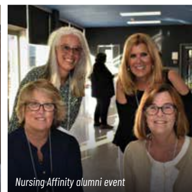
Nursing Affinity alumni event