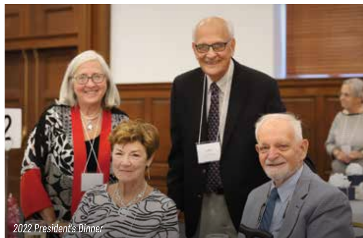
2022 President's Dinner