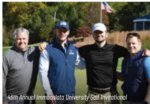
46th Annual Immaculata University Golf Invitational