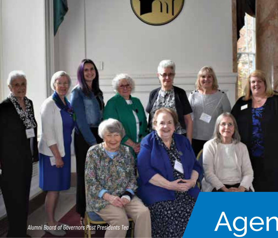
Alumni Board of Governors Past Presidents Tea