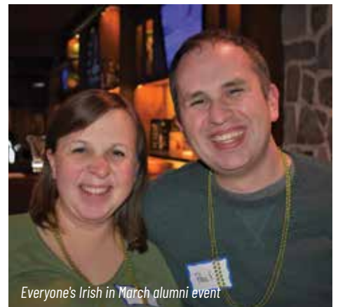
Everyone's Irish in March alumni event