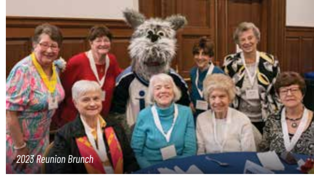
2023 Reunion Brunch