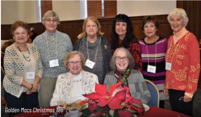
Golden Macs Christmas Tea