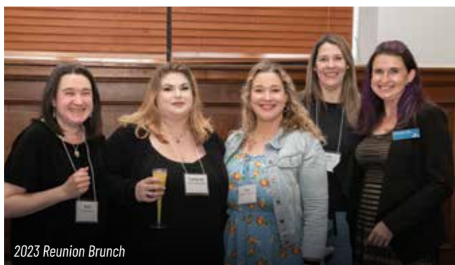
2023 Reunion Brunch