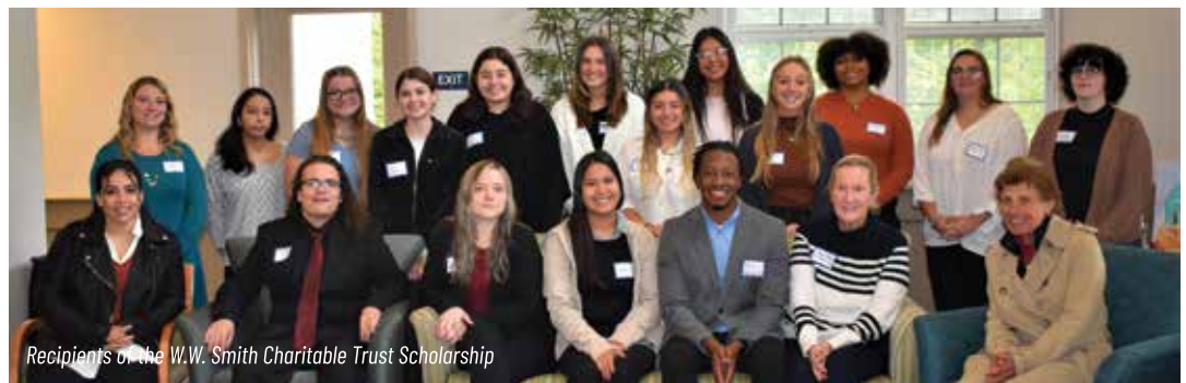
Recipients of the W.W. Smith Charitable Trust Scholarship