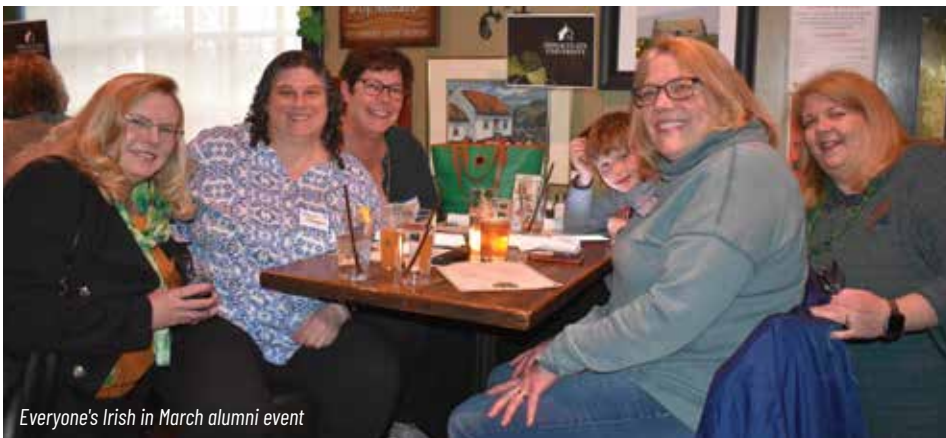
Everyone's Irish in March alumni event

Alumni affinity gatherings, Reunion, Carol Night, NCAA Division III games, performances by the Immaculata Symphony and Cue & Curtain Theatre and more—we have a LOT of activities and events on campus throughout the year. Stop by to see first-hand all that is taking place on our beautiful campus! Contact the Office of Alumni Relations if you will be visiting campus and let us know: alumnidept@immaculata.edu .