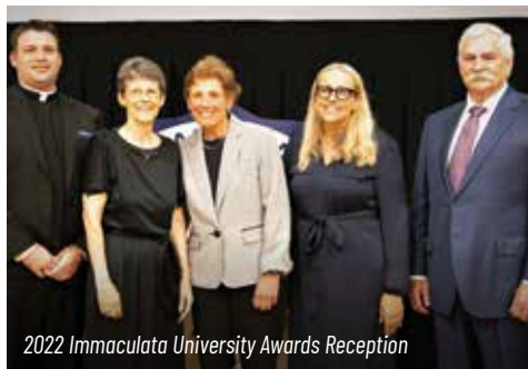
2022 Immaculata University Awards Reception