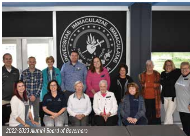
2022-2023 Alumni Board of Governors