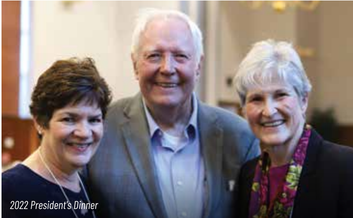
2022 President's Dinner