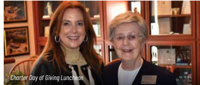
Charter Day of Giving Luncheon