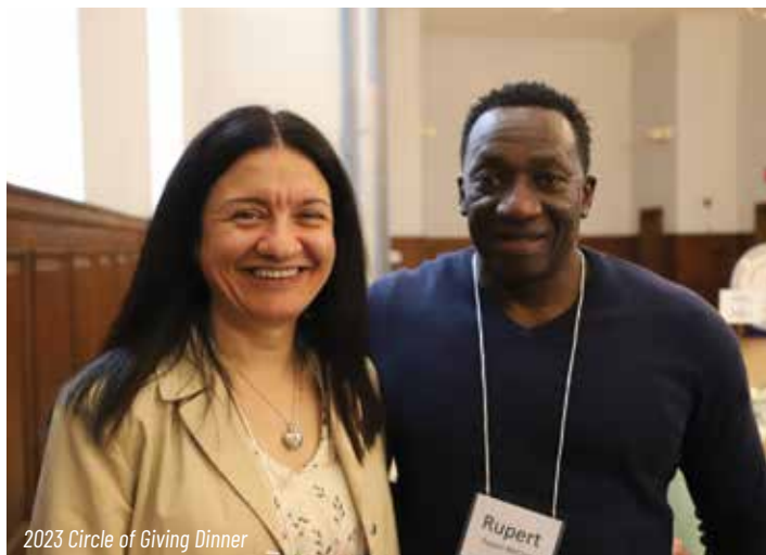
2023 Circle of Giving Dinner