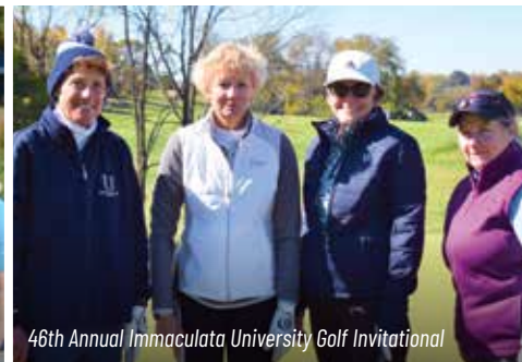
46th Annual Immaculata University Golf Invitational