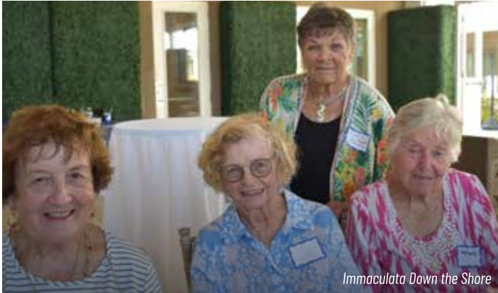
Immaculata Down the Shore