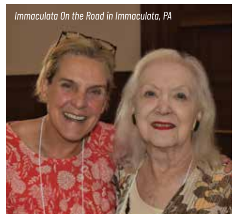
Immaculata On the Road in Immaculata, PA