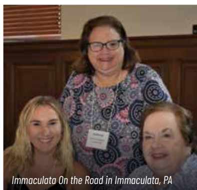
Immaculata On the Road in Immaculata, PA