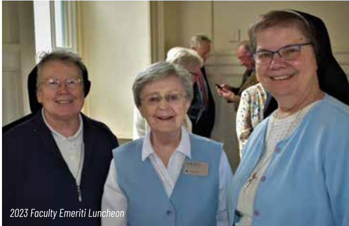
2023 Faculty Emeriti Luncheon