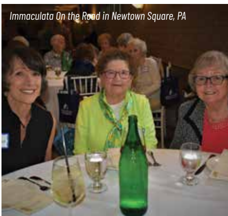
Immaculata On the Road in Newtown Square, PA