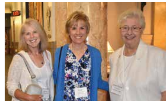
Pictured L to R: Immaculata On The Road in Immaculata, PA; Education Affinity event; Sips and Dips event.