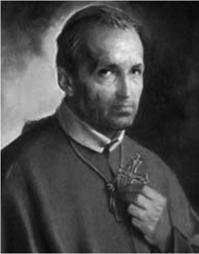
St. Alphonsus Ligouri, C.Ss.R.