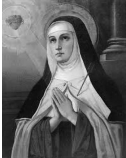
St. Teresa of Avila